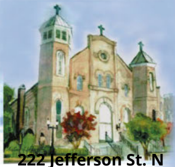
222 Jefferson St. N