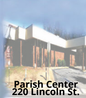
Parish Center 220 Lincoln St.

Oldest Catholic Parish in North Alabama—Established 1861