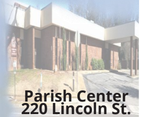
Parish Center 220 Lincoln St.

Oldest Catholic Parish in North Alabama—Established 1861