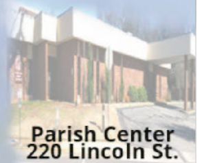
Parish Center 220 Lincoln St.

Oldest Catholic Parish in North Alabama—Established 1861