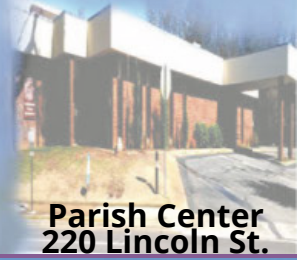
Parish Center 220 Lincoln St.

Oldest Catholic Parish in North Alabama—Established 1861