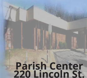
Parish Center 220 Lincoln St.

Oldest Catholic Parish in North Alabama—Established 1861